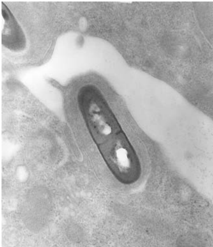
Figure 1. Listeria monocytogenes .

contamination. 4 Because of the potentially severe consequences, it is important that practicing obstetricians are familiar with the diagnosis, treatment, and prevention of listerial infection.